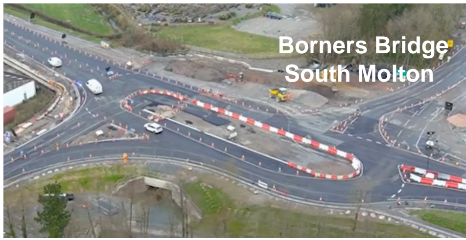
Borner's Bridge South Molton

Please also check out our project website for more information or to see the site team community.alungriffiths.co.uk