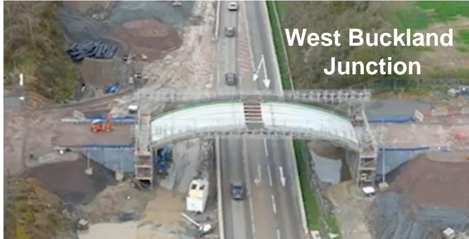
West Buckland Junction